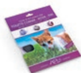
Ricambio filtri S07070100