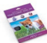
Ricambio filtri S07070100