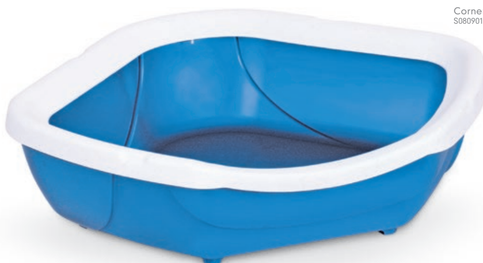
Corner Open S08090100