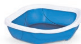
Corner Open S08090103